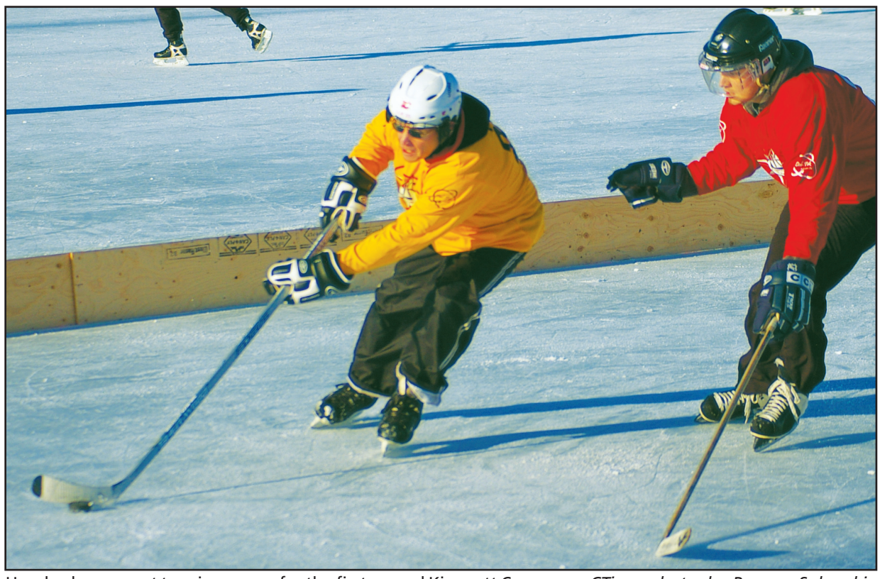
Hundreds came out to raise money for the first annual Kimmett Cup.