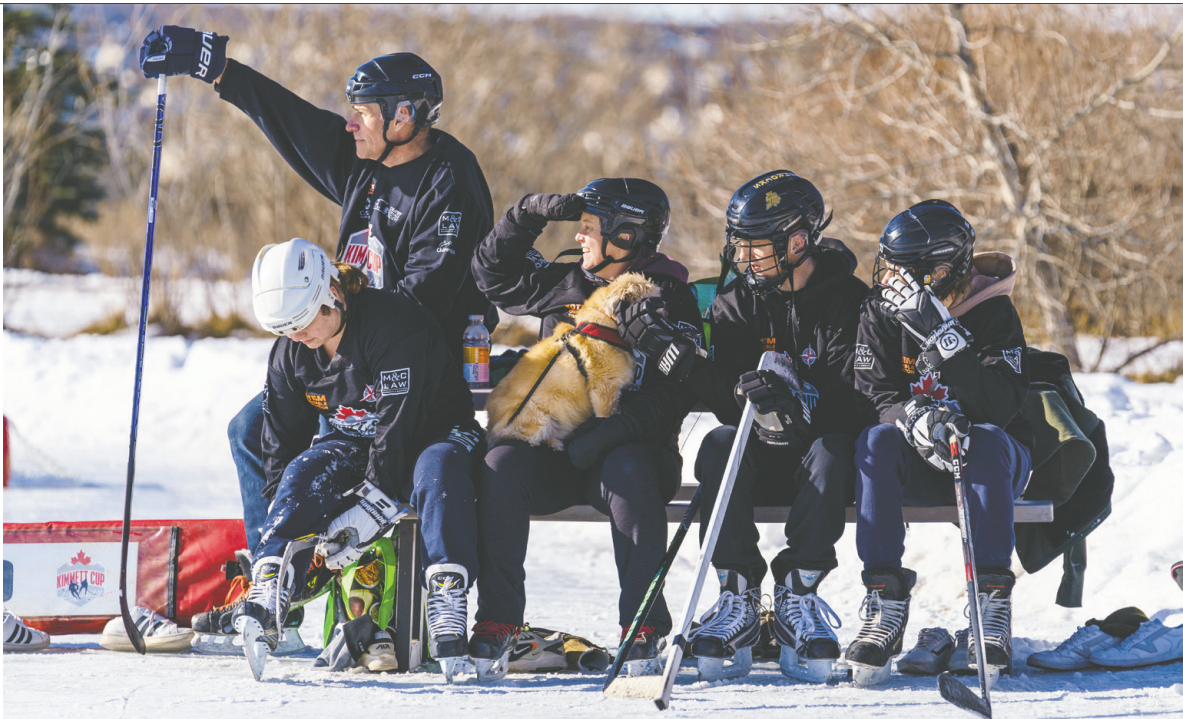
Players watch their team during the Kimmett Cup at the Mitford Ponds in Cochrane on Saturday, Feb. 11, 2023.