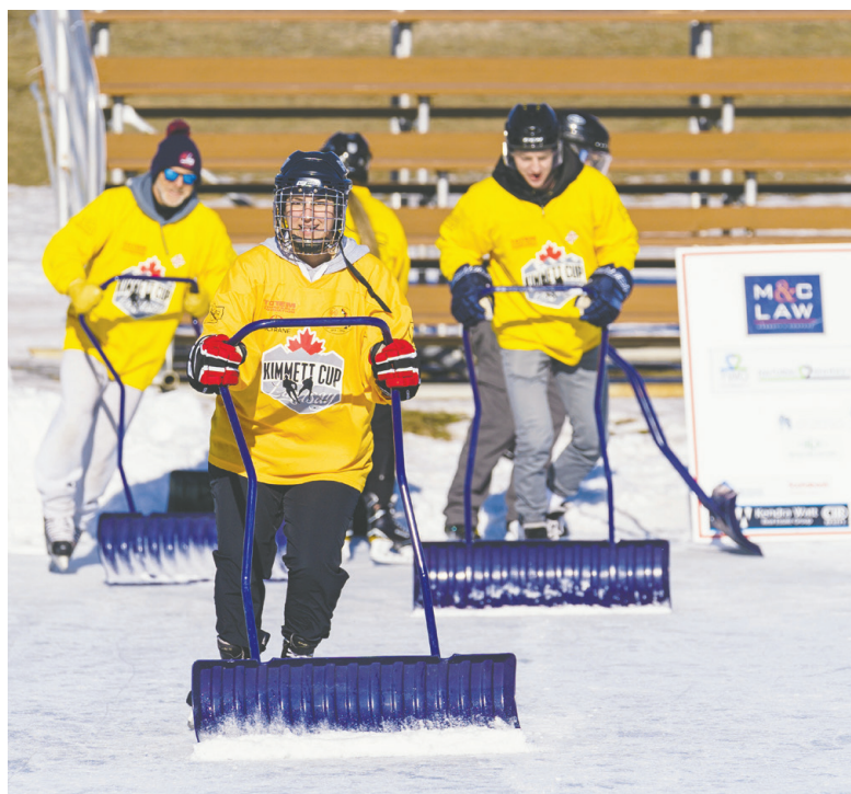
Players clear off the ice after play for the Kimmett Cup at the Mitford Ponds in Cochrane on Saturday, Feb. 11, 2023.

The Cochrane Times is a member of the National Newsmedia Council, which is an independent ethical organization established to deal with editorial concerns. For more information or to file a complaint go to www.mediacouncil.ca or call toll-free 1-844-877-1163.