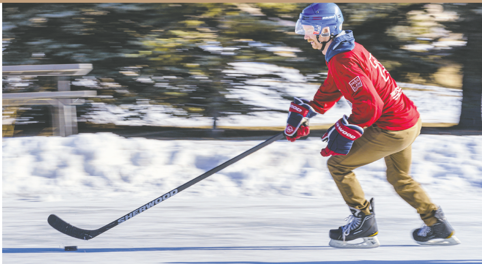
A player skates with the puck during the Kimmett Cup at the Mitford Ponds in Cochrane on Saturday, Feb. 11, 2023.