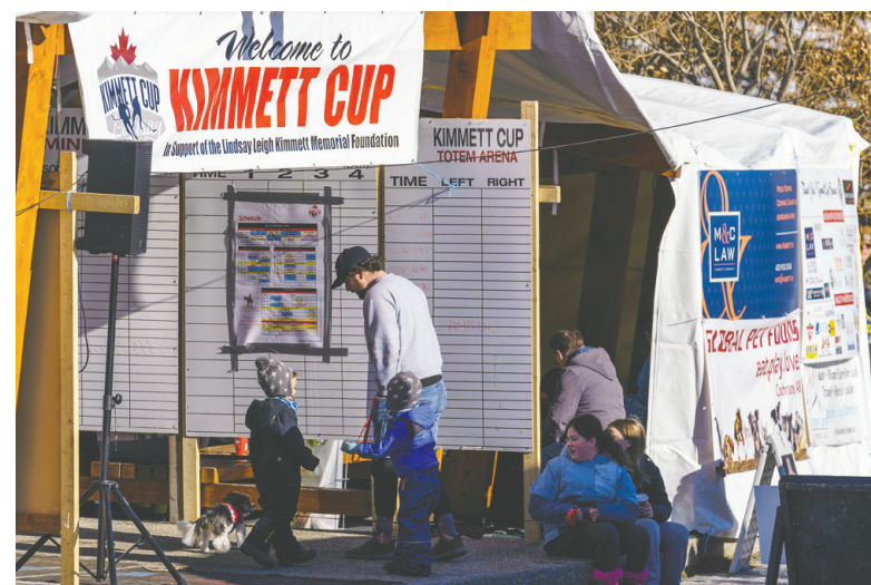
The Kimmett Cup at the Mitford Ponds in Cochrane on Saturday, Feb. 11, 2023.

"When she passed away, we were at a loss for how we could continue some of the good in the world that she wanted to do in her life," he continued, "This tournament has become the conduit to do that."