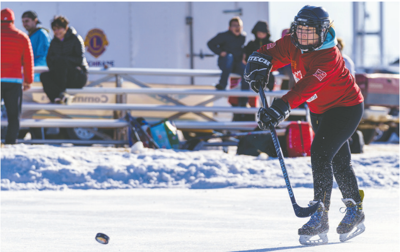
A player passes the puck during the Kimmett Cup at the Mitford Ponds in Cochrane on Saturday, Feb. 11, 2023.