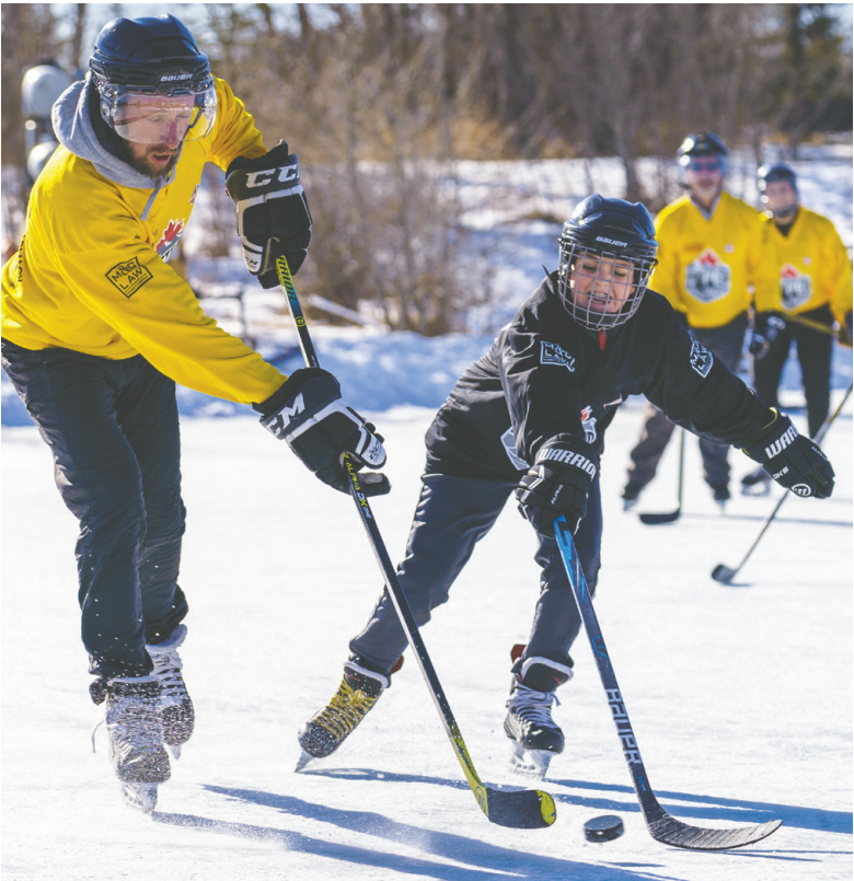
Players battle over the puck during the Kimmett Cup at the Mitford Ponds in Cochrane on Saturday, Feb. 11, 2023.